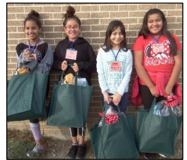
Gifts of Love packing & Gifts of Love giving