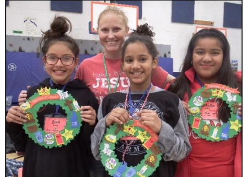
Bible storytelling and Kids Club festivities