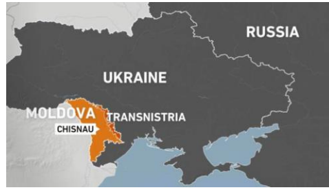
Proximity of countries