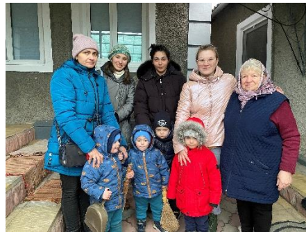
Mothers, grandmas, and children fleeing