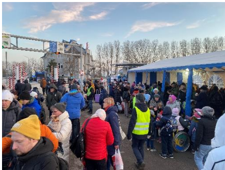
Endless line of people at the border

One Way International has had a twenty-four-year relationship with our brothers and sisters in Christ in Moldova. Moldova borders Ukraine. All the individuals with whom we have worked are making daily trips to the border to give out food and other supplies, pick up refugees and transport to the capitol, give them a place to stay, feed them, and purchase tickets for buses to continue their journey to other places. Some refugees are staying in Moldova; others are meeting relatives and friends in other countries to wait until they can return home or begin new lives in new places. People of Moldova are very poor and yet they are caring for thousands of moms, babies, children, and elderly in very rich ways. Following are photos being taken and sent by Pastor Stas and Alina. Vitaly and Natasha care for the deaf in Moldova and are working tirelessly to care for Ukrainian deaf as they cross the border. The border trips are long, dangerous, and exhausting in very cold and difficult conditions. Please pray for our dear brothers and sisters in Christ.